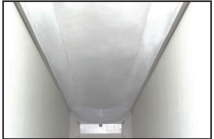
Tube Chutes with Unimax-Tube Adapter